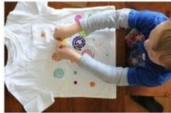
Design a T-Shirt